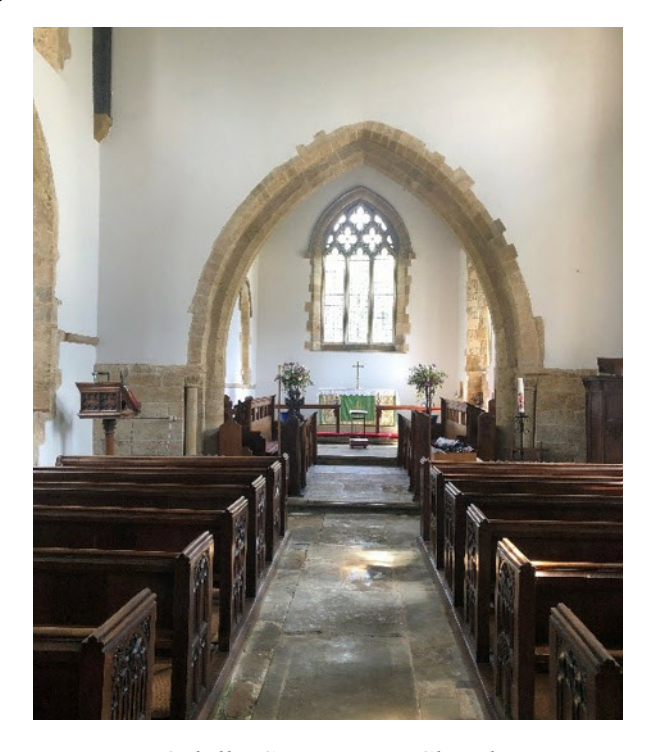
Oxhill's St Lawrence Church

If you would prefer not to join us in church, we entirely understand: most of the time there will also be a Zoomed service available on a Sunday, and the Wednesday Morning Prayer will continue as a Zoomed service.